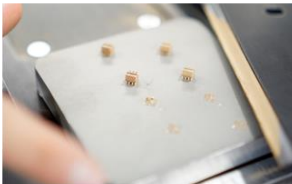
Image 2: Sample from a scanning electron microscope in the Research Institute for Precious Metals and Metal Chemistry (fem).

New ways of transferring technology and knowledge are proved, in order to especially support small and medium sized enterprises (SME) which often are not able to keep research capacities by themselves. As technology transfer is also useful to foster the economic use of resources, recovery of phosphorus from sewage sludge is supported from development to implementation in an exemplary manner.