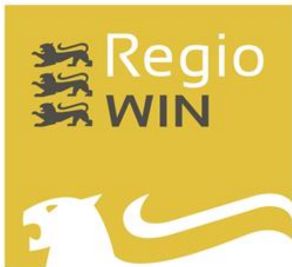
Image 4: The RegioWIN competition promotes regional competitiveness through innovation and sustainability.

The competition met with big response from all parts of the country and suggests that the ERDF reaches directly the citizens.