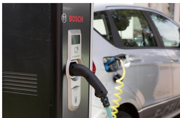
Image 3: Electric car in a charging station.

The transformation of the energy system and the increase of energy efficiency are prerequisites for a sustainable society. And since Baden-Württemberg has relatively few resources the economy is depending on supplies from other countries whose pricing and reliableness is beyond of control. Energy transition is therefore the second priority of the ERDF programme in Baden-Württemberg.